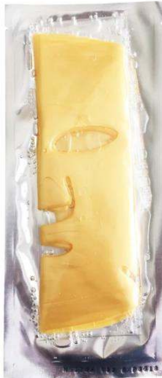
Passport To Beauty Gold Radiance Luxury Facial Mask With Collagen And Rose Oil, $35, passporttobeaauty.com

I won't lie: This mask looks kind of creepy. But it will rejuvenate and restore your skin. Plus, you can even store it in the fridge for a pleasant cooling sensation.