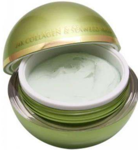
Orogold 24K Collagen & Seaweed Mask, $298, orogoldcosmetics.com

This mask works to restore volume, firmness, and moisture to aging skin with the help of gold, seaweed, and collagen.