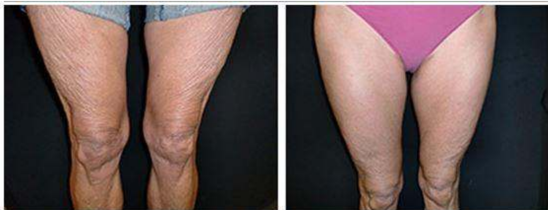
Exilis Ultra Before & After.

intense hot stone massage — spaced one to three weeks apart are required to achieve optimal results, which will last about two years.