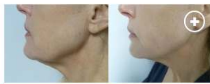
Before (left) and after (right). Most Ultherapy patients are said to notice results after one session, which costs up to $5,000.